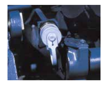
Hydraulic Trailer Brake (Optional)

As an added measure of safety, the hydraulic trailer brake makes trailer towing safer, even on slopes.