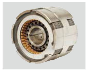
Hydraulic Wet Clutch Unlike a conventional dry-type clutch, the hydraulic wet-type clutch is more responsive and extremely durable.

For increased safety and reliability, the M108S features an independent parking brake system and a separate drive brake linkage.