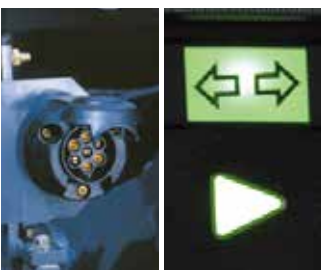
Trailer Coupler/ Trailer Indicator A trailer coupler and indicator are both available for use with either a trailer or additional implements.

As an added measure of safety, the hydraulic trailer brake makes trailer towing safer, even on slopes.