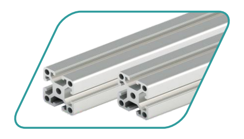
Aluminium alloy material