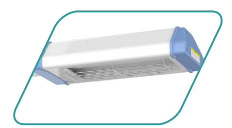
Heating head with metal grid